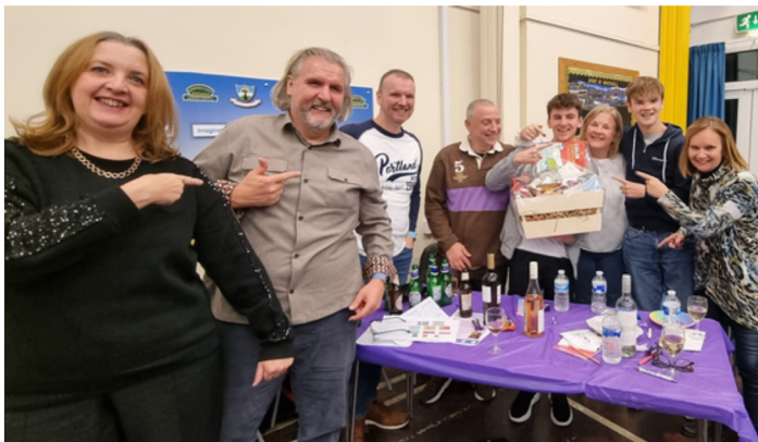
THE WINNING TEAM - ICKLEFORD MASSIVE

The successful quiz night, which drew over 100 contestants, raised more than £1,300 to help support bereaved children and young people in North Herts and Stevenage.